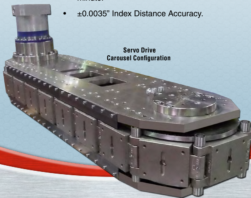
Servo Drive Carousel Configuration