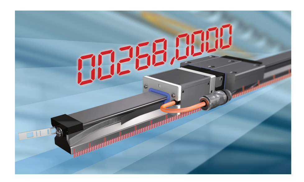
High measuring accuracy even under harsh metalworking conditions increases machining quality and surface quality.

The interchangeable design offered by Rexroth ensures even less effort. All runner blocks of the same size fit onto all rails of the corresponding size without any restrictions. Replacement is as easy as pulling the scanner off