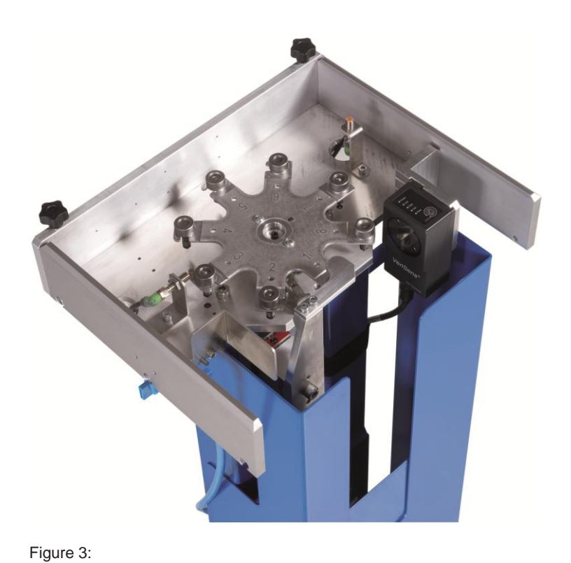
RIVSET die changer - up to eight dies For prototyping, small series/series production and spare parts management