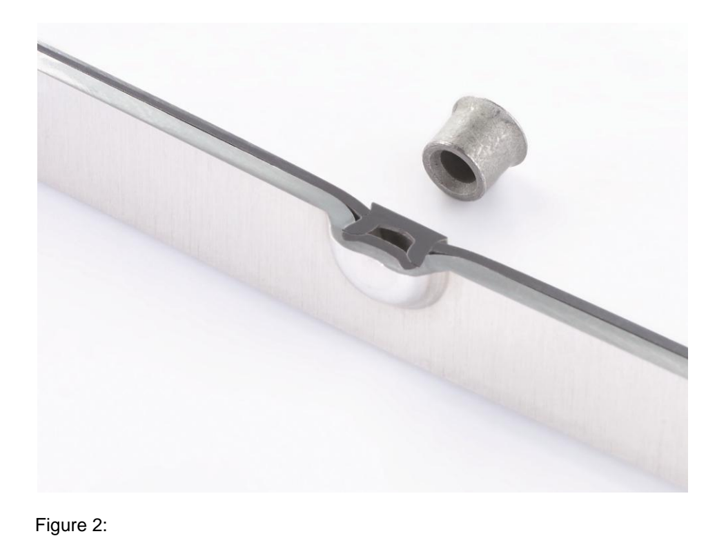
RIVSET HDX Example of a high-strength application: 1.5 mm high-strength steel, 2.0 mm aluminium