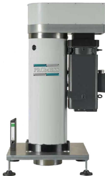
On the larger side, a 500 kN Promess EMAP press.

Promess Inc. is the leading manufacturer of highly adaptive motion-control and monitoring systems used by companies around the world to test and assemble the products they produce. Design, manufacturing, and executive headquarters are located in Brighton, Michigan.