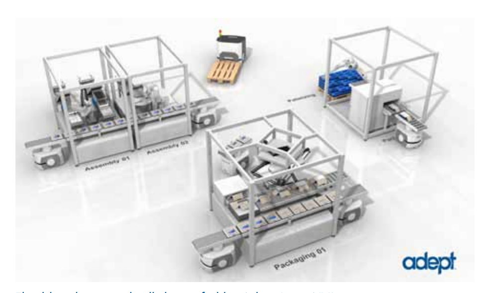
Flexible robotic workcells being fed by Adept Lynx AIV's.